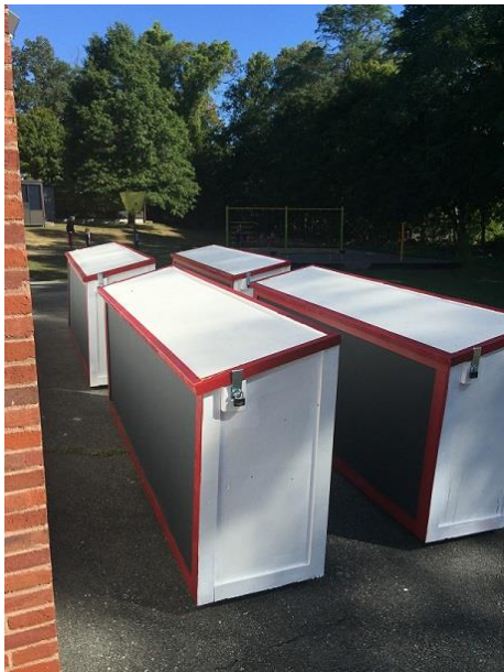
Storage Boxes for New Outdoor Learning Space

Thank you all so much for coming out to support Cutler at 15 Walnut last month! We are waiting to hear back on the total amount that we raised, but we had a much better turn out this year and are positive it will be a great kick-start for our Annual Fund Drive. More info will be coming soon on how else you can contribute :-). The money raised will go directly to the Outdoor Learning Space!